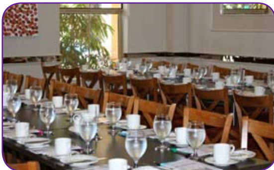
March 2012 High Tea Event

The WA AFMW Facebook group has been successful in increasing interest in the AFMW and women's health, with news and events being posted in the forum regularly. Feedback from the High Tea function showed that most guests heard about the event through Facebook, so it is a great way to access members. There are currently 76 Facebook members on the AFMW's WA page. The WA AFMW group is looking forward to continued growth.