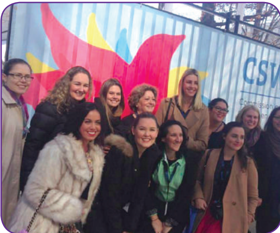
AFMW delegates at the 59th Commission on the Status of Women at the United Nations in New York, 2015