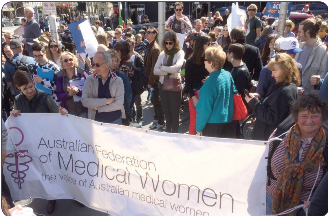
AFMW members supported the Global Climate Action Rallies in Sydney & Melbourne

The AFMW is also a member of the Australian Women's Coalition (AWC) (a group of women's organisations that works collaboratively to advance the status of women, by presenting the views of Australian women to Government) and the Equality Rights Alliance (formerly WomenSpeak) Network, a non-government secretariat that provides representative advice on policy issues affecting women, including childcare, women's health, women's leadership, young women, the role of men and boys in gender equity and violence against women.